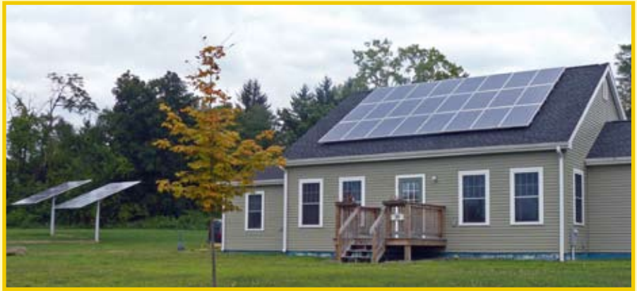
SunDog Solar installed solar power panels at COARC sites this year, shown here at our Shasta Drive Home in Claverack. Panels were also installed in Hudson at our Ravish Road Home , COARC Contract Manufacturing on Second Street, Promenade Hill Center on Warren Street and our Prospect Place Offices , home of The Starting Place and Cardinal Hall .