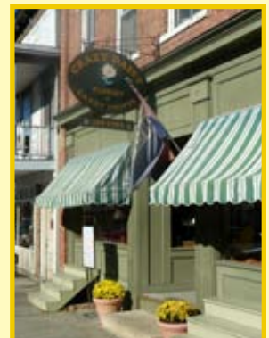
Crazy Daisy , Valatie, NY