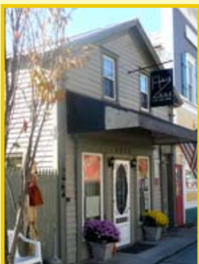
Hair Zone , Valatie, NY